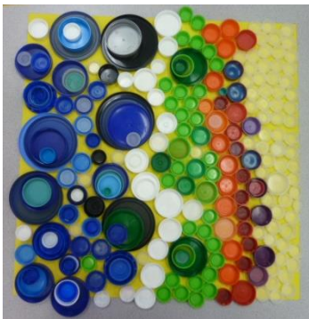
Lassiter Team Mural