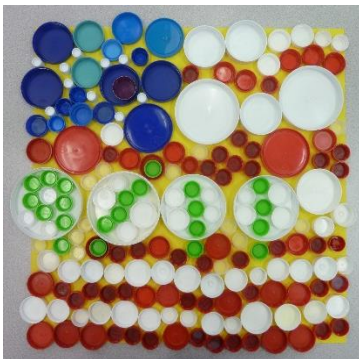
Harrison Team Mural

At the beginning of the year, third and fourth grade learned about Installations. All types of installations: temporary, permanent, recycled, environmental. We worked together in teams to create an ABSTRACT temporary installation using colored recycled lids. Filling a 22-inch square with the lids facing with the flat side down. We discussed and defined “abstract” into two categories: organized and random. In some classes, teams chose to use other recycled items like cubes. We realized they needed more time to fill the square with cubes, so they look finished. The teams created some very creative abstract installations. Fifth grade classes created “permanent” installation murals for display at Buck Lake and I had hoped that some additional classes would have the opportunity to create some permanent installations also but time ran out.